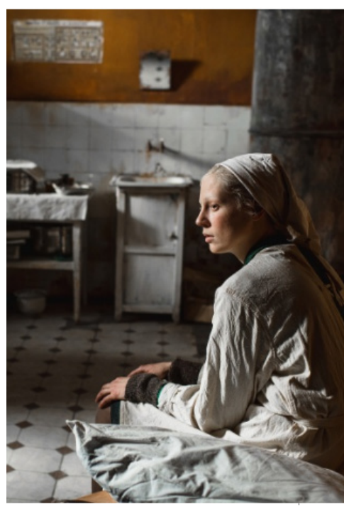
BEANPOLE Dir. KANTEMIR BALAGOV