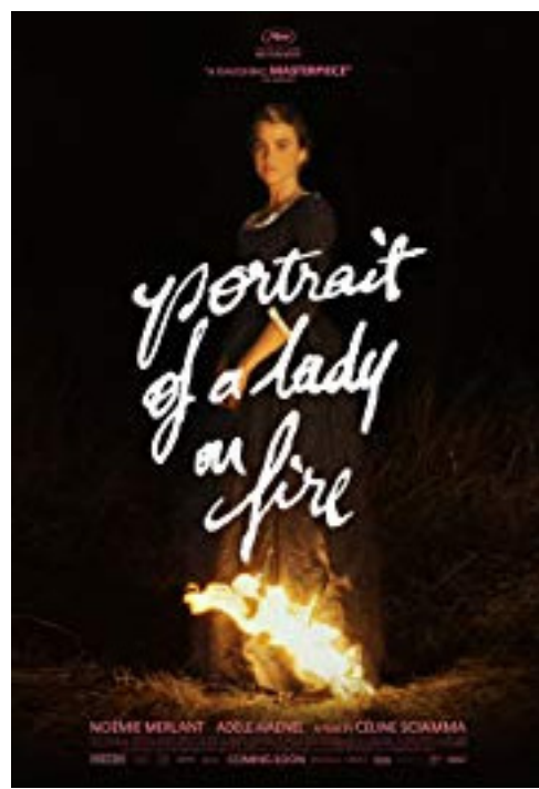
PORTAIT DE LA JEUNE FILLE EN FEU Dir. CÉLINE SCIAMMA