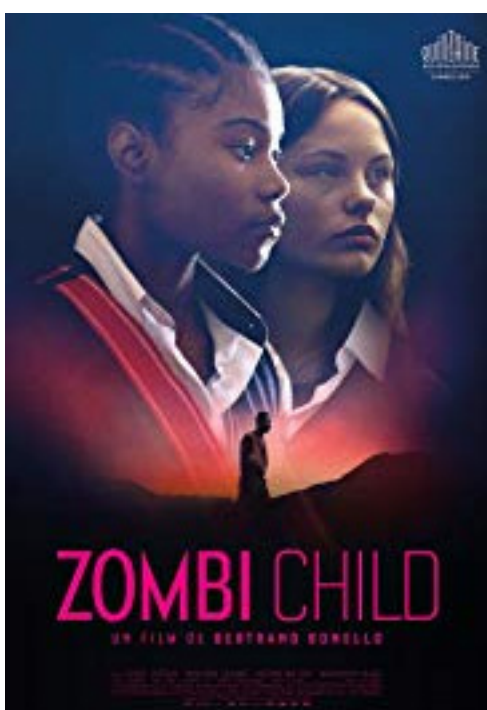
ZOMBI CHIL Dir. BERTRAND BONELLO