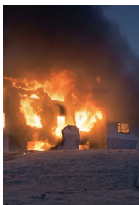
SOME BEASTS Dir. JORGÉ RIQUELME SERRANO

Sanctuary is the tale of a media, scientific and political campaign aiming to protect the planet's last remaining pristine area. We accompany the Bardem brothers who, as spokesmen for the Antarctic Sanctuary campaign, must use the tools available to them to obtain massive popular support for the initiative. We will see how science, politics and social media come together to mobilise almost 3 million people to support this initiative which ultimately depends on a political decision.