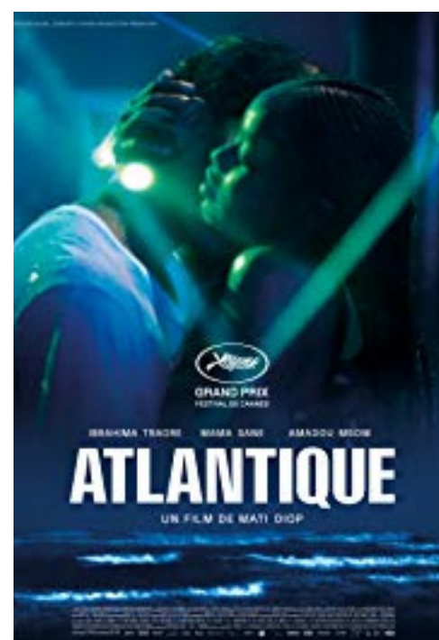
ATLANTIQUE Dir. MATI DIOP