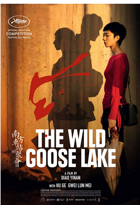
NAN FANG CHE ZHAN DE JU HUI / THE WILD GOOSE LAKE Dir. DIAO YINAN