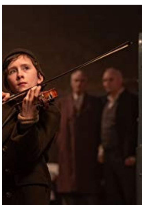
THE SONG OF NAMES Dir. FRANÇOIS GIRARD